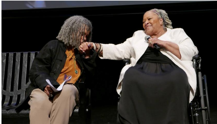
Cover and Back Cover Photo: Bob Gore for the Schomburg Center (2016)

Founded in 1925 and named a National Historic Landmark in 2017, the Schomburg Center for Research in Black Culture in Harlem is the world's leading cultural institution devoted to the research, preservation, and exhibition of materials focused on African American, African Diaspora, and African experiences. One of four research libraries of The New York Public Library and seeded by the collection of Arturo Alfonso Schomburg over 90 years ago, the Schomburg Center collects, preserves, and provides free access to materials documenting Black life locally, nationally, and internationally.